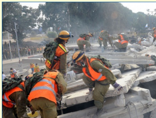
Israel's Earthquake Drill October 2012

The APF is the sole organization, designated by the State of Israel, to maintain this Emergency Medical Volunteer Registry.