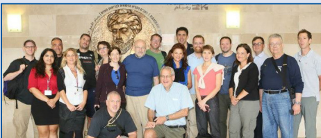
2012 Participants at Rambam Hospital

For more information about APF's Emergency and Disaster Preparedness Course contact the APF office at 617-232-5382; or email: info@apfmed.org ; or visit our website at: www.apfmed.org